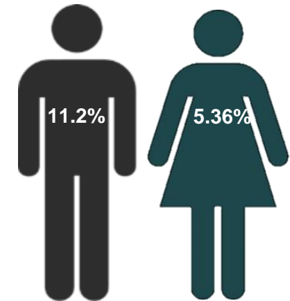
Proportion of Men and Women Paid a Bonus during the bonus pay period

The national mean gender pay gap is 15.5%. Our mean pay gap is well below the national average. The calculation for ordinary pay is based on a snapshot period that includes 5 April 2020. The bonus pay calculation is based on the 12-month period 6 April 2019 to 5 April 2020 inclusive.